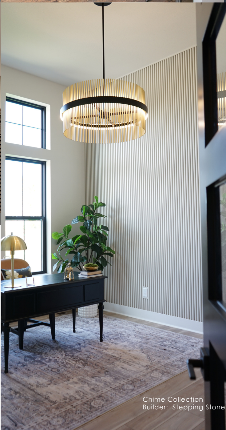
Chime Collection Builder: Stepping Stone

As a total lighting resource, Maxim offers approachable designs and elevated elegance from partner you can trust. This vision is enhanced by the bold, modern aesthetic of ET2. Complementing Maxim's familiar, reliable designs, ET2 embodies modern luxury with refined statement pieces and sculptural forms. Blending forward-thinking elegance with form and function, ET2 delivers distinctive lighting solutions that elevate any space and perfectly balance our product offering.