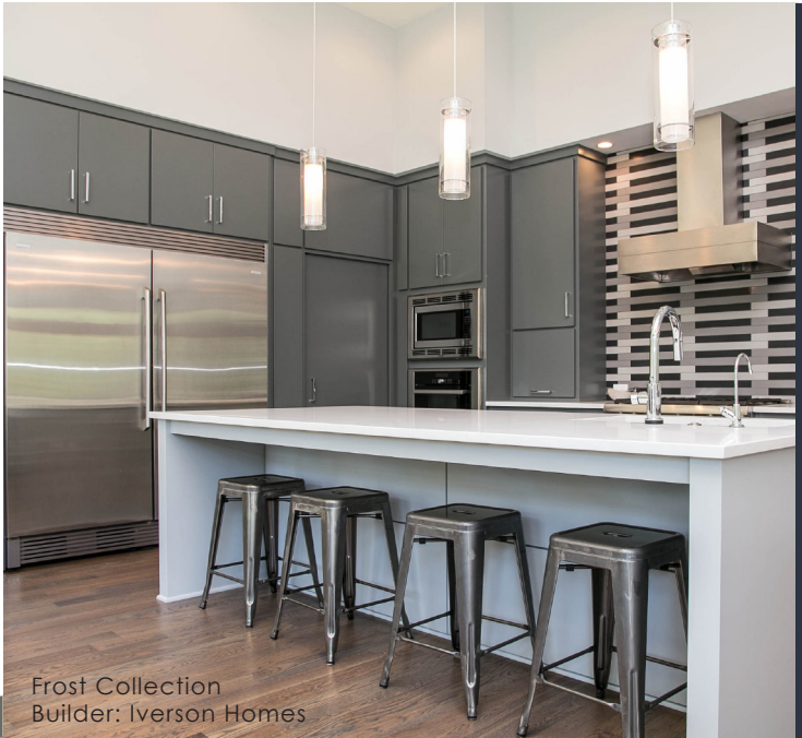
Frost Collection Builder: Iverson Homes