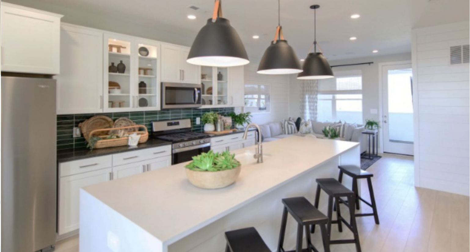
Nordic Collection Builder: Van Daele Homes

“ With a relationship that spans over 14 years, it would be our recommendation to look at their program to the builder trade. Maxim is in touch with the market needs of the production builder and has the service to support it. ”