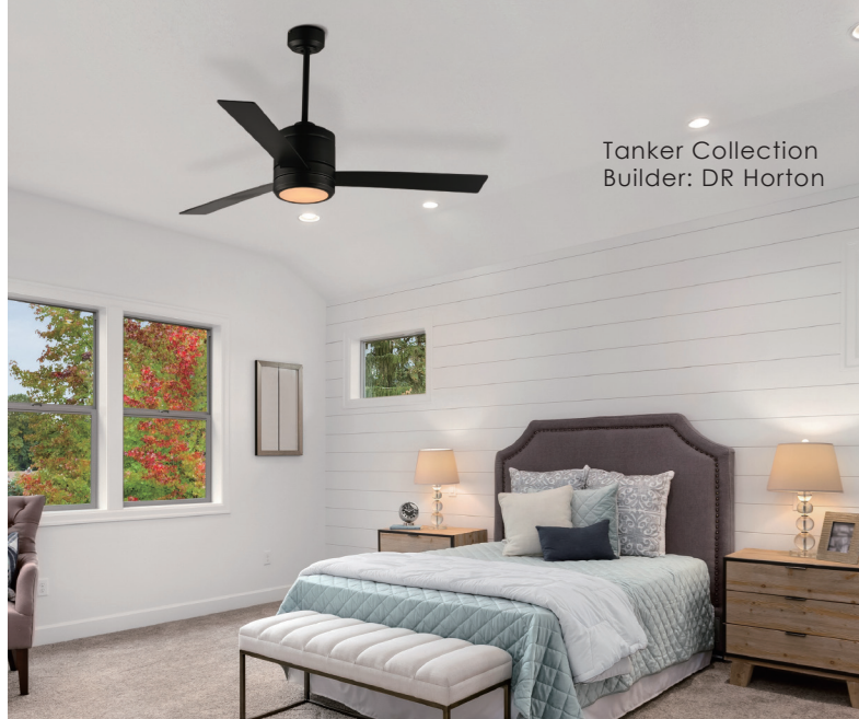
Tanker Collection Builder: DR Horton