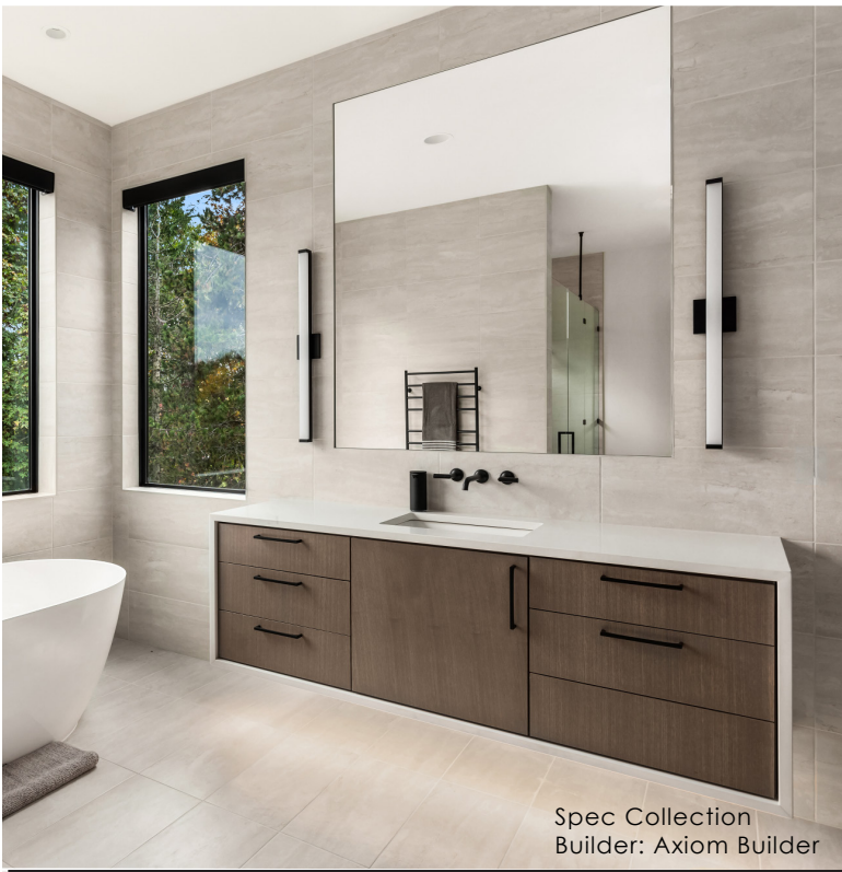
Spec Collection Builder: Axiom Builder