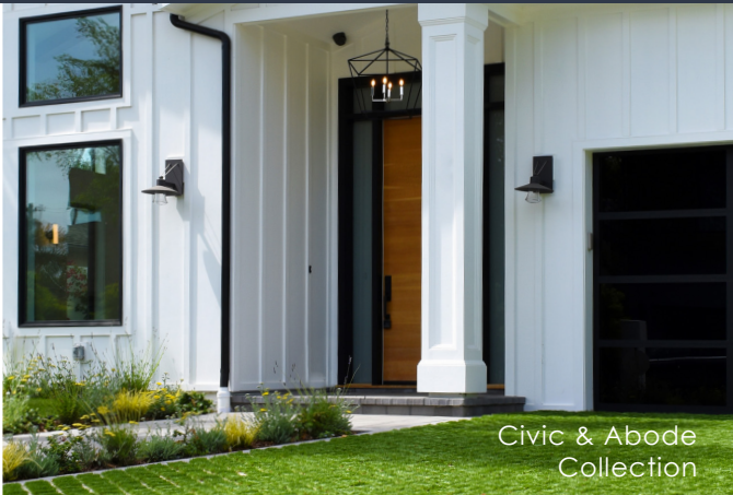
Civic & Abode Collection

First impressions start outside. The right exterior lighting not only enhances your home's architecture but also adds security and curb appeal. Maxim and ET2 offer a wide range of outdoor fixtures designed to complement any style, ensuring your home stands out—day or night. From modern minimalism to timeless elegance, explore endless possibilities to bring brilliance and life to your exterior spaces.