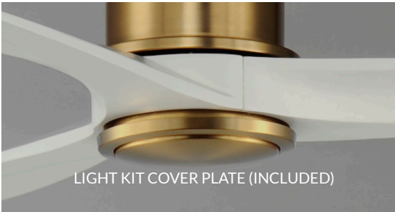
LIGHT KIT COVER PLATE (INCLUDED)