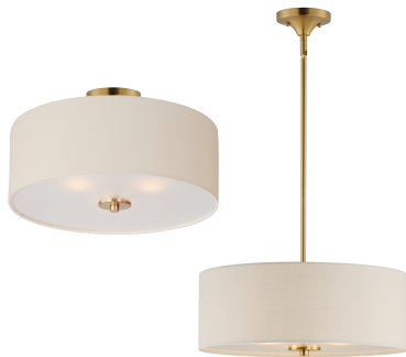
Convertible to Pendant