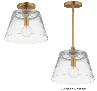
Convertible to Pendant