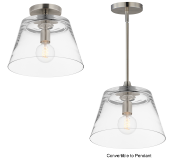
Convertible to Pendant