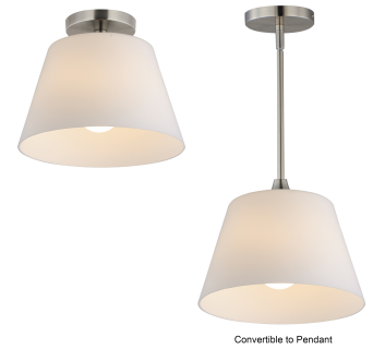
Convertible to Pendant