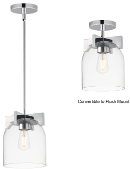
Convertible to Flush Mount