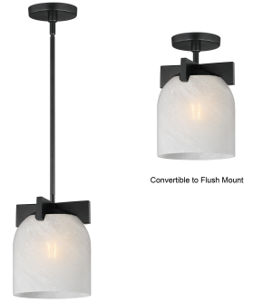
Convertible to Flush Mount