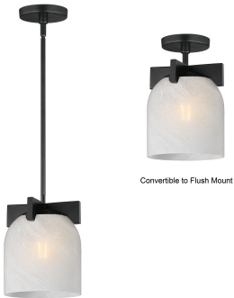
Convertible to Flush Mount