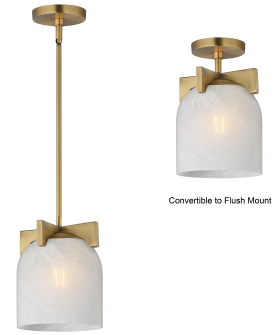
Convertible to Flush Mount