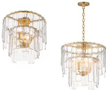
Convertible to Pendant