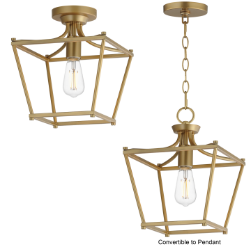
Convertible to Pendant